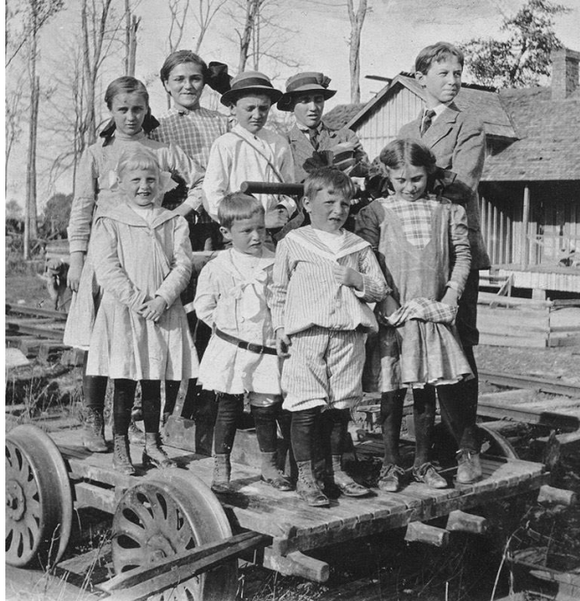
Not our family but is a handcar.

Sab 18 Mar 1894 Pleasant until 3 or 4 oc when we had quite a thunder shower. The frogs were very musical today Mon 19 A pleasant day but quite a cold N.E. wind I rode over to Akron on the hand car to try my hand Tues 20 Cool & cloudy with light squalls of rain in the after-n. I took a ride on the hand car this mornng [ THERE WERE RAIL ROAD TRACKS NEAR SOME OF THE PLACES WHERE HE HAD LIVED SO WE WONDER IF HE BORROWED A HANDCAR TO TRAVEL ]